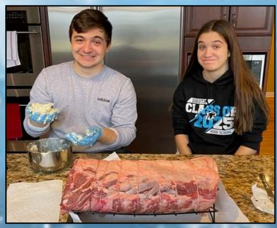
The excitement of applying herb butter to a 19 pound prime rib!