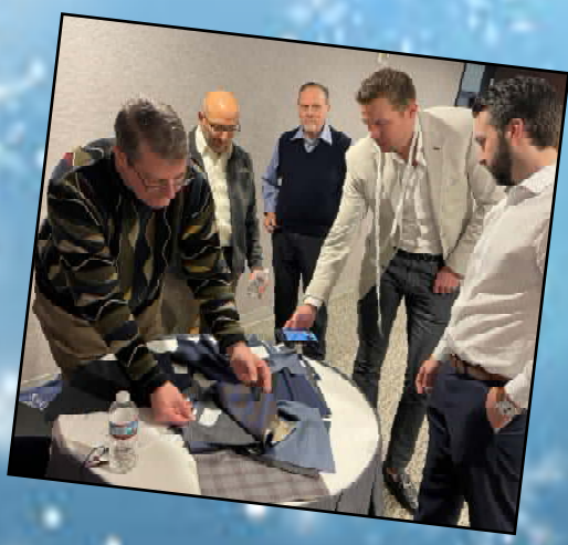
Our CFOs received custom tailored sport coats for the Holidays! They had the chance to pick out their own fabrics and will be looking sharp in 2022!