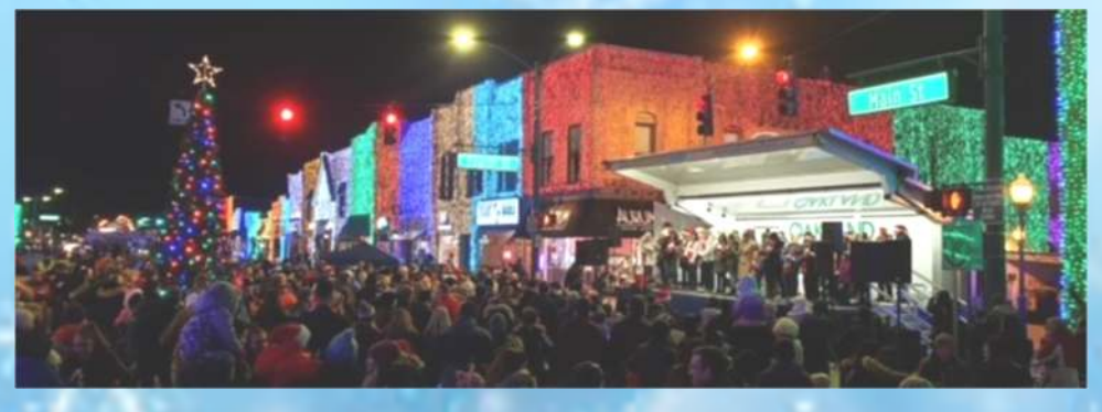
The Holiday lights in downtown Rochester are always a must see!