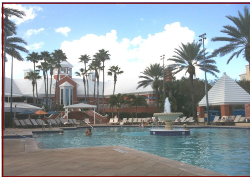
Walking in a Winter Wonderland?

Just after Thanksgiving, my family and I spent a week in Orlando for a long-overdue vacation. The weather was nice and we had a very relaxing time. I will tell you that it's a little bizarre to sit by the pool in 84 degrees, sun blazing, palm trees overhead and listen to "Winter Wonderland" and other Christmas songs piped through the resort's sound system.