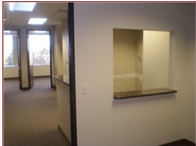
A view from the front entrance